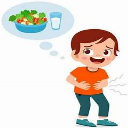
hun g er