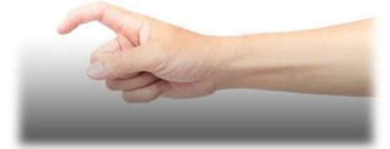
fin g er