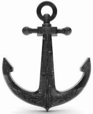
an ch or