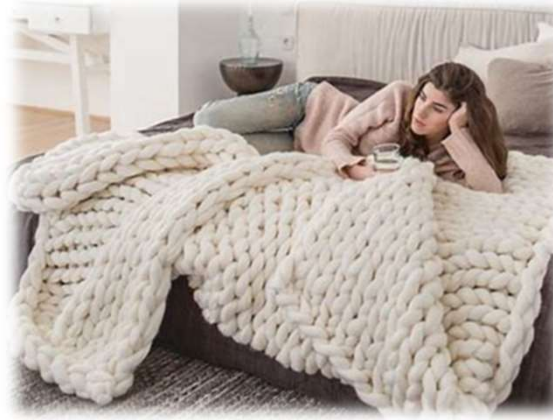
blan k et