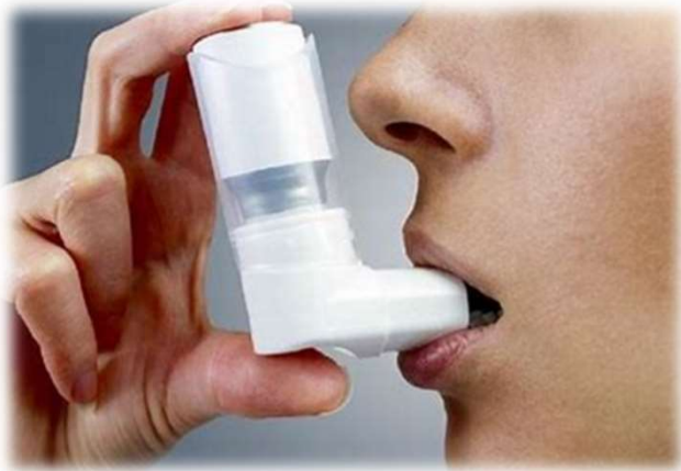
inh a ler