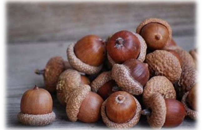
a c orn