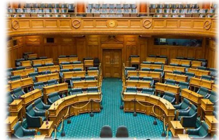
cha m ber