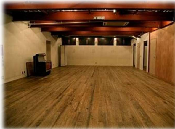
va c ant