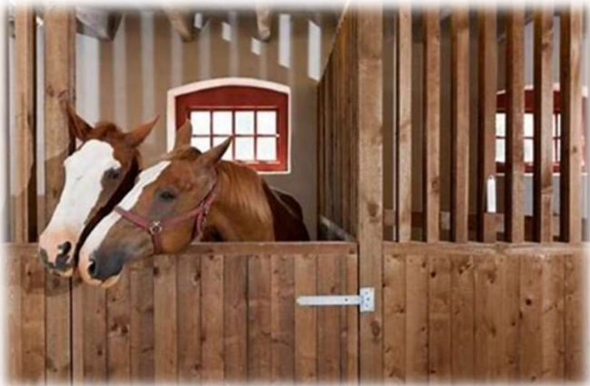
sta b le