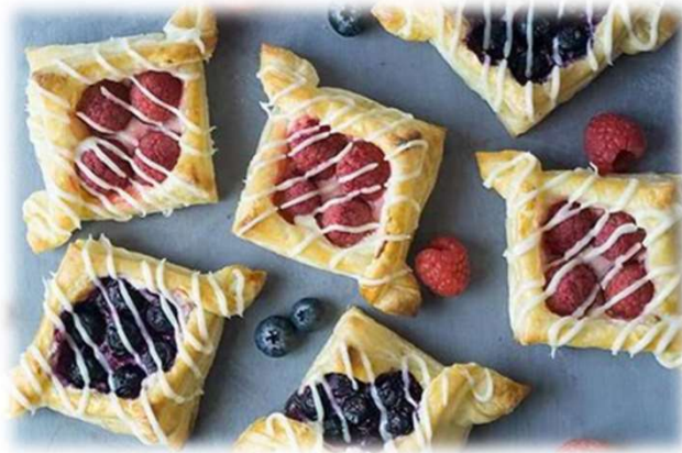
pa s try